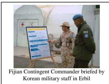
Fijian Contingent Commander briefed by Korean military staff in Erbil