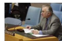
SRSB Qazi addresses SC-15/3/06

In his statement before the SC, the SRSB said despite the notable achievement of all the political transition benchmarks in 2005 that had been envisaged in resolution 1546, Iraq continued to face enormous security, political and reconstruction challenges, given which the country’s progress in meeting transitional benchmarks was all the more remarkable.