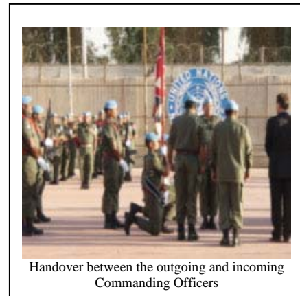
Handover between the outgoing and incoming Commanding Officers