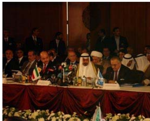
High-Level preparatory meeting on the International Compact with Iraq (ICI) – Kuwait, 31 Oct 2006