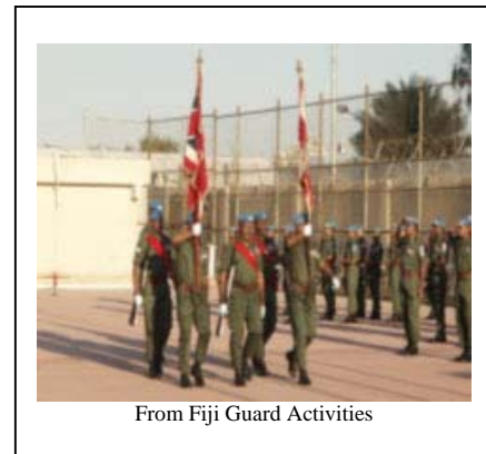
From Fiji Guard Activities