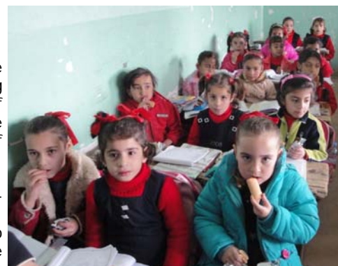
Primary school children in Telkief district of Ninewa governorate begin receiving date bars from WFP in December 2009

In December, distributions in support of vulnerable groups, namely pregnant and lactating mothers, malnourished children under 5, TB patients, female heads of household, small farmers in addition to the assistance to the food insecure Internally Displaced Persons (IDPs) continued inside Iraq, although not at the planned pace. Shortages in white beans has translated into delays in distributions in areas such as Babel. Distributions are scheduled to resume when the next shipment of beans arrive.