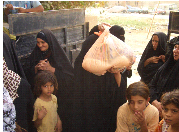
Distribution of food baskets to food insecure families - Abu Ghraib

With the conclusion of the initial project in December 2007, the K4IWS maintained the medical clinic with their own resources until June 2008 -- the local population again swelled with arriving displaced -- when they were again granted funding through the ERF to support their medical clinic (including the procurement of an ultrasound, ECG and employment of a dentist) and to expand their activities to include nutritional food baskets and educational outreach programs focused on raising community awareness regarding personal health and hygiene.