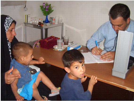
A beneficiary receiving medical assistance - Abu Ghraib / Baghdad

Abu-Graib in western Baghdad Governorate has faced its fair-share of hardships over the course of the Iraq war. It's population has swelled and depleted with those fleeing violence and persecution of the city; and those arriving to seek a safe haven with family and friends. The violence and population movements have had a devastating effect on local infrastructure making life exceptionally difficult for the Iraqi individuals and families who currently live there.