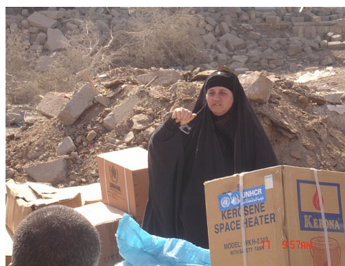
NFIs' emergency intervention in Shrekhan village, Mosul