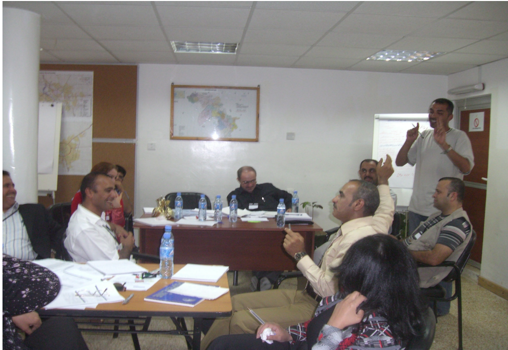
Participants take part in the Disaster Management Workshop