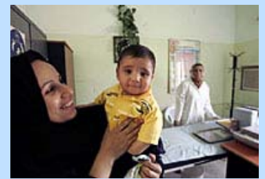
A mother and baby smile after immunization. Campaigns such as these are sometimes the only chance Iraqi mothers have to get critical vaccines for their babies.

distribution to all Governorates has started.