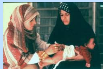
Immunization is critical to protect young babies Against potentially lethal diseases

With UNICEF support, a two day workshop was conducted for 30 participants representing the National Health Education Committee at the Ministry of Health (MoH). The main objectives of the workshop were to inform the committee of the national communication and social mobilization strategy and identify their roles within their respective ministries.