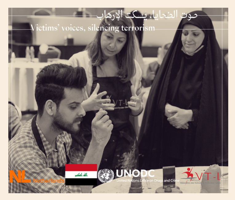
<u>"Victim's Voices, Silencing Terrorism"</u> <u>campaign documentary</u>

The programme also helped identify legislative and procedural gaps and challenges concerning the protection and treatment of victims of terrorism before, during, and after criminal proceedings and showcased the importance of a strong and efficient judicial system in providing access to justice for victims. Participating judges have also gained awareness of the crucial role emotional well-being and cognitive abilities play in their professional performance, particularly when dealing with victims of terrorism.