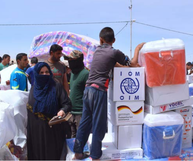
Above: IOM distributed non-food item kits to recently displaced Iraqis in Qayara Airstrip emergency site. The kits were funded by the Government of Germany. The kits include mattresses, blankets, pillows, coolers, rechargeable fans and lights, gas cookers and other necessary items.