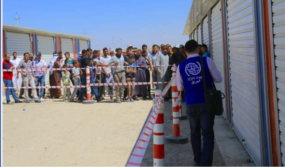
Above: IOM completed the construction of 80 shops at Qayara Airstrip emergency site and handed over the keys to beneficiaries on 24 April. These shops will host a range of stores from grocery, barbering and clothing stores and more. The stores will create income for the IDPs, provide essential goods and services to the camp population, and to promote social cohesion through meaningful work. The project is funded by the US Department of State, Bureau of Population, Refugees, and Migration (PRM)