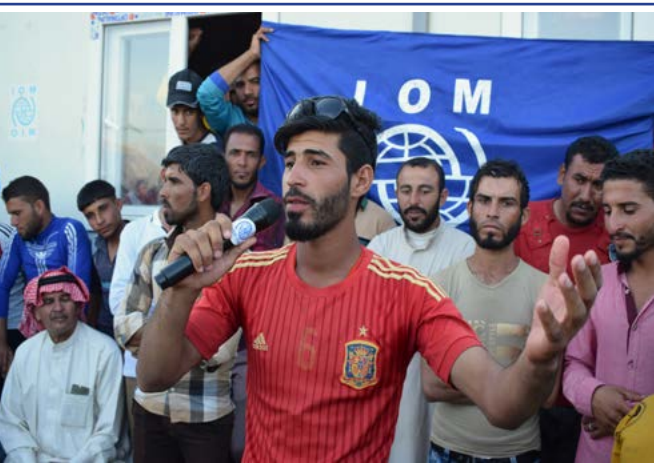
Above: Every Thursday, IOM's Psychosocial Team brings together poets and poetry lovers in Qayara Airstrip emergency site to give them a podium to express their dreams, hopes, and longings.