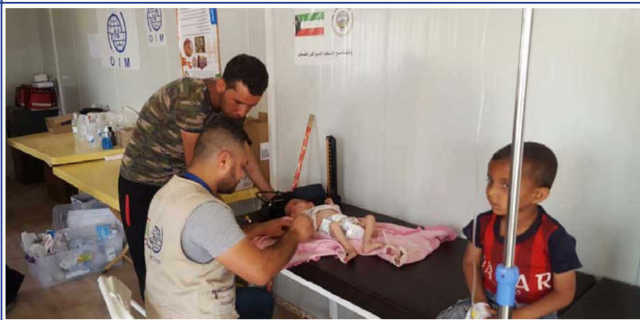
Above: IOM-Department of Health (DoH) doctor checks a sick baby at Haj Ali emergency site. IOM medical clinic and mobile medical units in collaboration with DoH provide primary health care support and medication to 1,750 displaced Iraqis per week in Haj Ali emergency site. These health activities are supported by the Government of Kuwait.