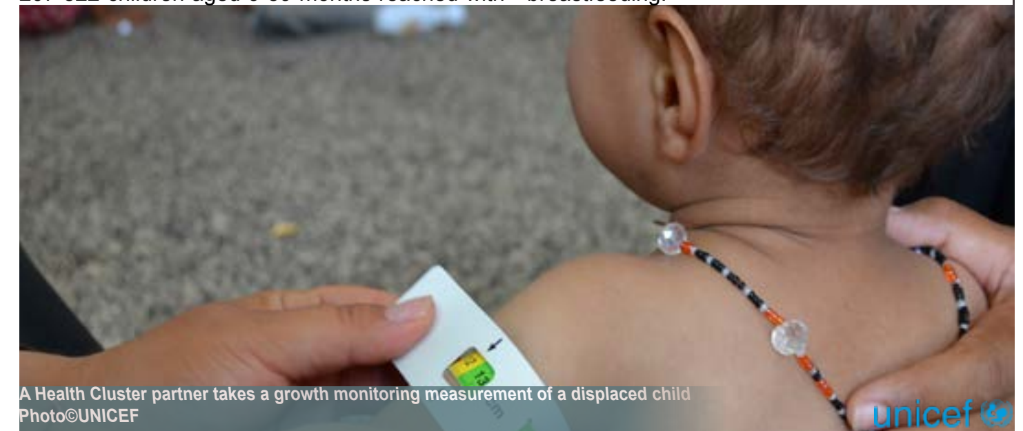
A Health Cluster partner takes a growth monitoring measurement of a displaced child