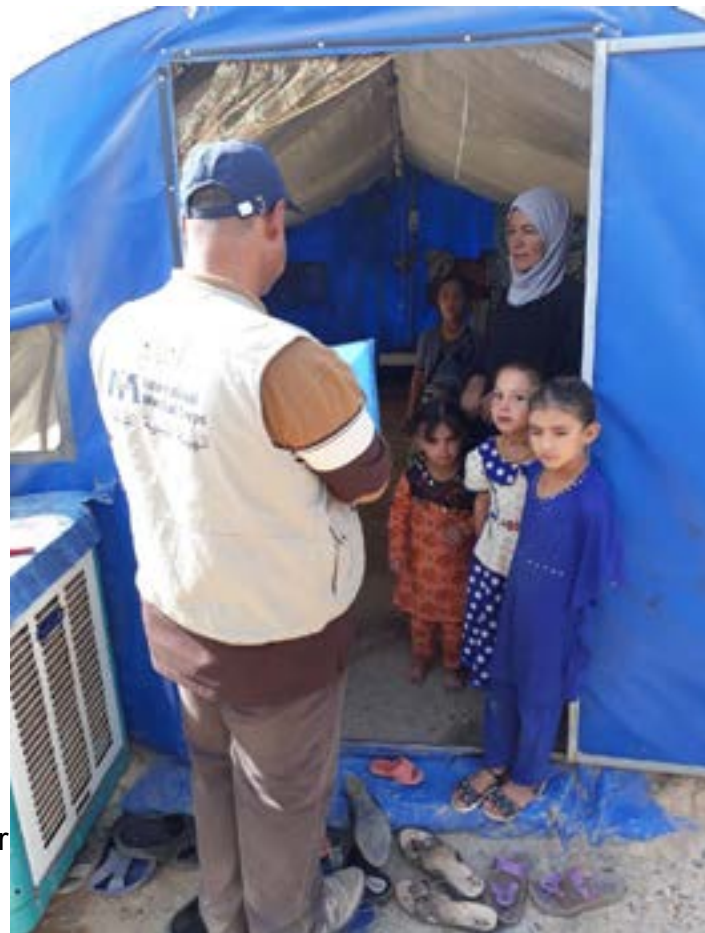
Mental health and psychosocial services outreach worker visiting Jedaa camp: Photo©International Medical Corps.