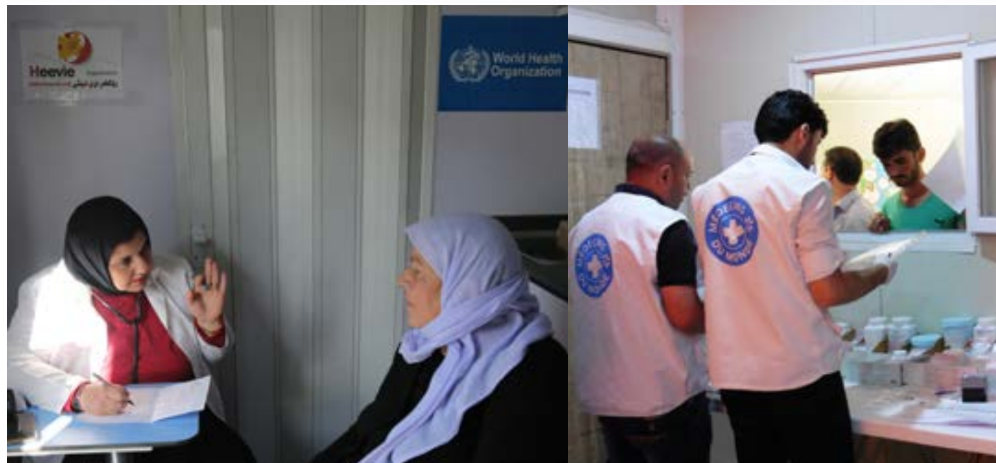
A displaced person receiving primary health care service in WHO supported clinic that is run by Heevie in Dahuk Governorate