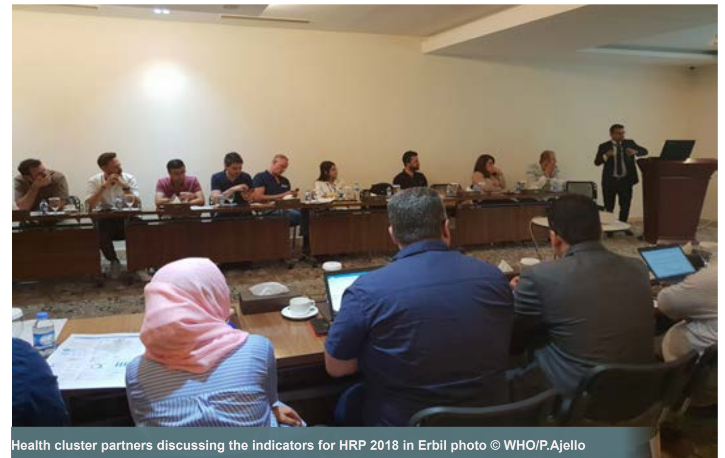
Health cluster partners discussing the indicators for HRP 2018 in Erbil

The health cluster had requested USD 109.6 million under the HRP 2017 and, by the end of the year, was fully funded. In order to develop the health section of the HNO and HRP 2018, the cluster used a participatory approach, incorporating feedback from the SAG members. In addition, the cluster conducted a workshop for all partners on 14th November, in which the objectives, activities and indicators to be included, monitored and reported against for 2018 were discussed and finalized.