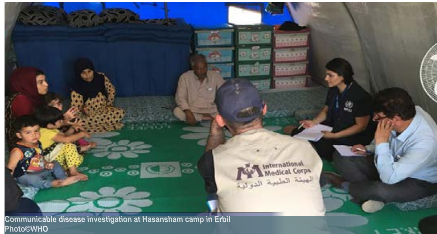
Communicable disease investigation at Hasansham camp in Erbil

The SAG was instrumental in the strategic and technical reviews of the projects submitted under the Humanitarian Pooled Fund (HPF) that had three allocations during 2017 (First Standard, Reserve and Hawija). This is in addition to supporting the development of the health component of the HRP 2018, including both the Humanitarian Needs Overview (HNO) and the Response Plan.