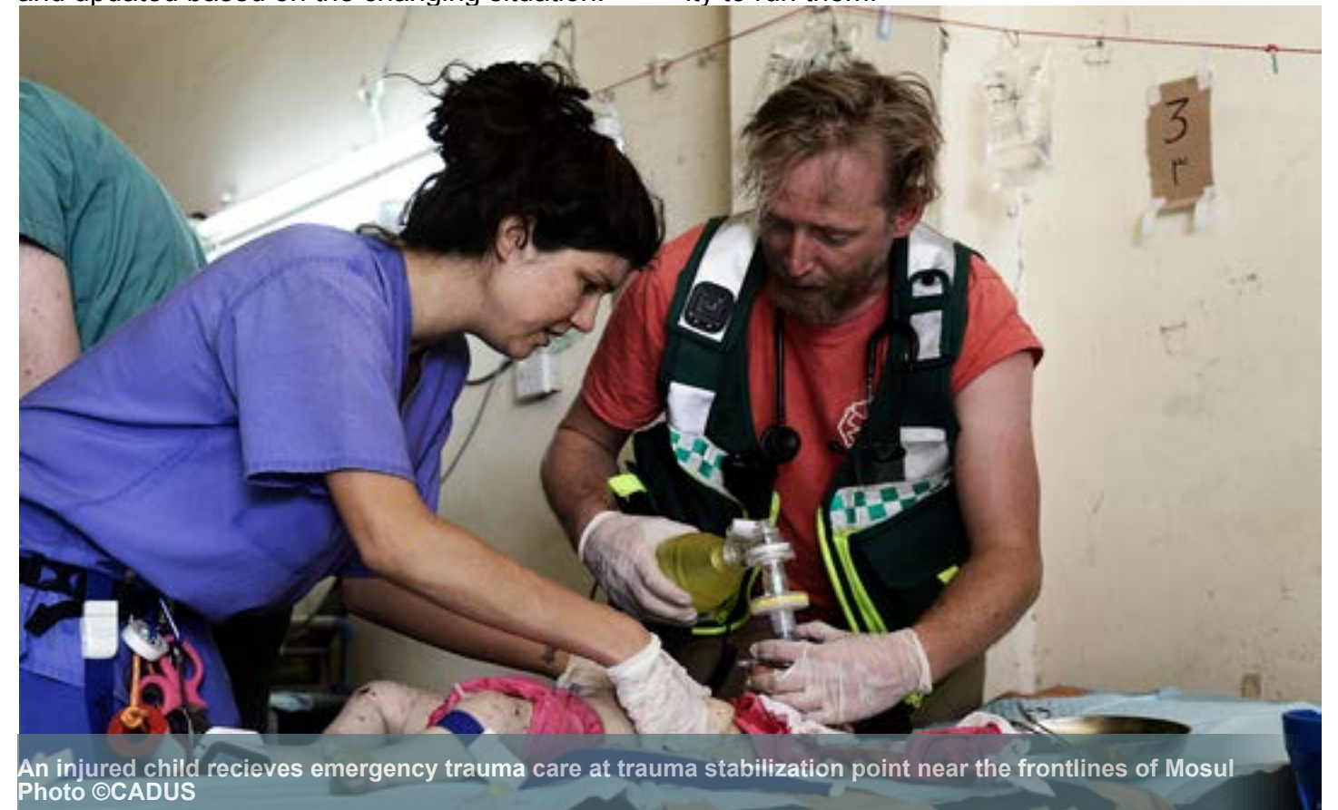
An injured child receives emergency trauma care at trauma stabilization point near the frontlines of Mosul

Subsequent to the conclusion of the military operations in Mosul, Hawija and west Anbar, the working group shifted focus of the field hospitals to the delivery of comprehensive secondary health care services, relocating and handing off the hospitals to the government as soon as they had the capacity to run them.