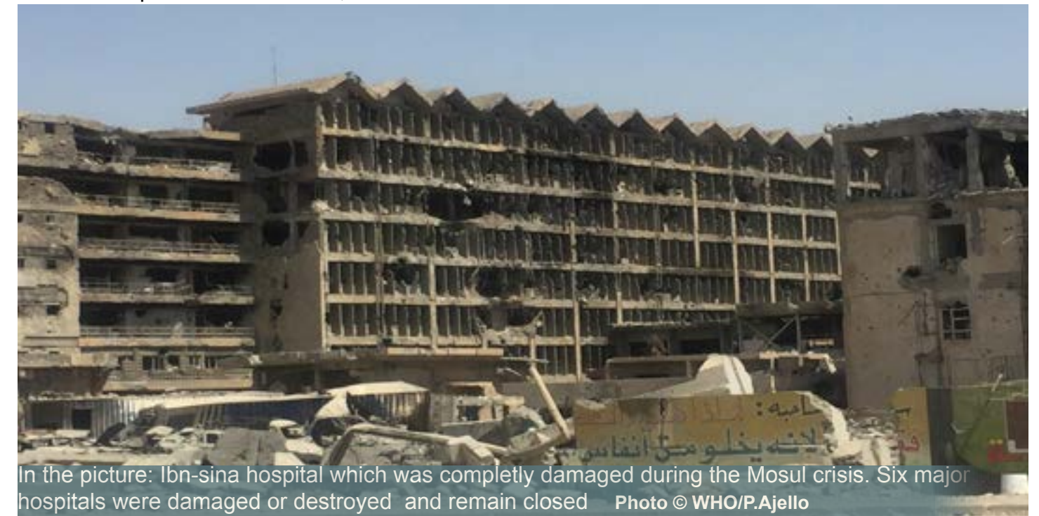
In the picture: Ibn-sina hospital which was completely damaged during the Mosul crisis. Six major hospitals were damaged or destroyed and remain closed

■ Iraq is endemic for cholera. In 2017, sporadic cases were recorded but were managed through close coordination between the Health, Water, Sanitation and Hygiene (WASH) cluster and Ministry of Health. In camps however, under suitable conditions, there should not have been any cases, but these were still recorded due to some under causative factors that have since been dealt with through the national cholera taskforce. Furthermore a cholera lessons learnt workshop was conducted to focus on the preparedness and response activities for cholera for the next year.