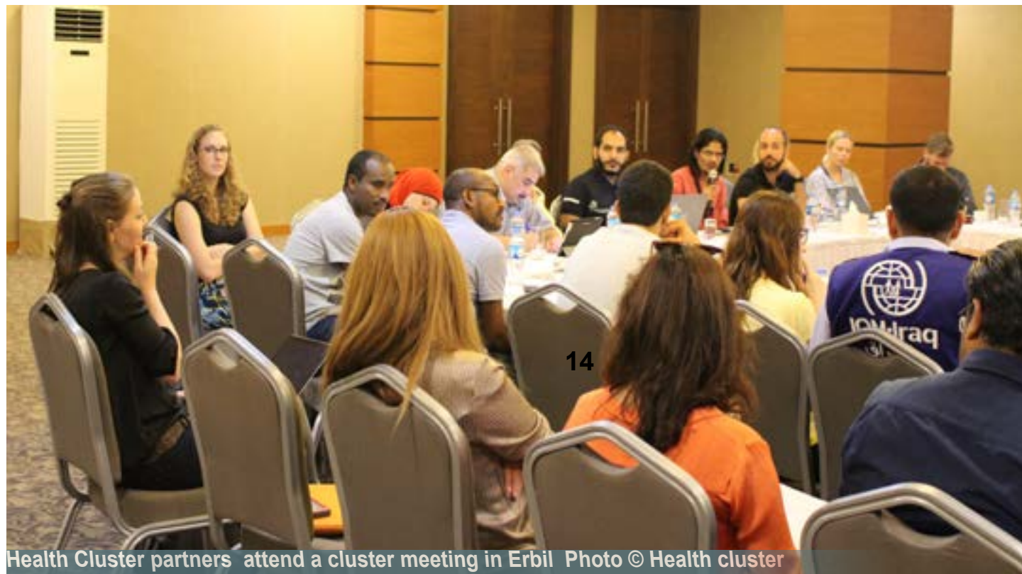
Health Cluster partners attend a cluster meeting in Erbil

6.2 million people affected by the conflict were reached during 2017, primarily through life-saving interventions, including trauma management, emergency primary healthcare services and sustaining a steady supply of essential medicines and supplies.