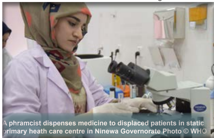
A pharmacist dispenses medicine to displaced patients in static primary health care centre in Ninewa Governorate

A food-borne illness incident occurred in Hasansham U2 camp on the 12th of June; health Cluster partners responded swiftly in coordination with DOH Ninewah and Erbil. Partners provided immediate life-saving response to manage patients with severe vomiting and through referral to their PHCC in Hasansham U3 camp). Of the 825 reported cases, 638 were referred to various health facilities, 386 cases having been admitted to hospitals within Erbil.