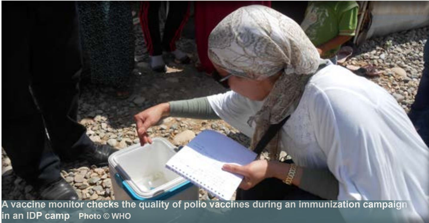
A vaccine monitor checks the quality of polio vaccines during an immunization campaign in an IDP camp