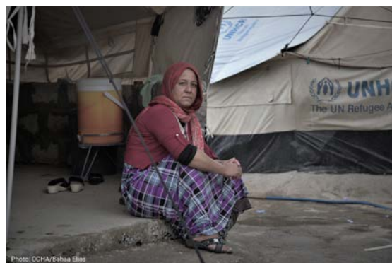
IDP woman from Sinjar district, Ninewa governorate, sits in front of her tent at Khanki IDP camp, Dahuk governorate. Returns of IDPs in camps have been slower than expected, raising concerns over their protracted displacement.

Despite government-imposed bureaucratic impediments and persistent access constraints affecting parts of the country, humanitarian partners have expanded their operational presence including in some newly accessible areas. Together, 105 humanitarian partners reached 1.3 million (38 per cent) of 3.4 million people targeted under the Humanitarian Response Plan (HRP) in the first five months of 2018. Response progress varied across clusters and geographical locations. Over 65 per cent of activities reported were in Ninewa governorate, where assessed needs were the most severe, while beneficiary reach and programmatic deliverables in other governorates were limited. Further, delayed donor contributions and unmet funding requirements have put off the commencement of some key humanitarian projects and are threatening the closure of those that have started.