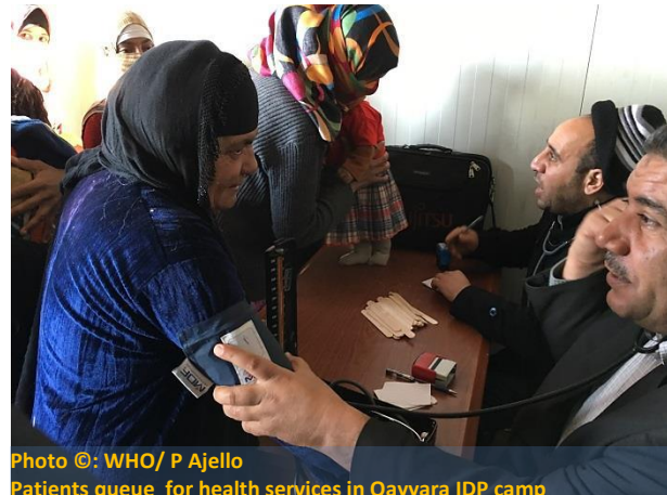
Patients queue for health services in Qayyara IDP camp