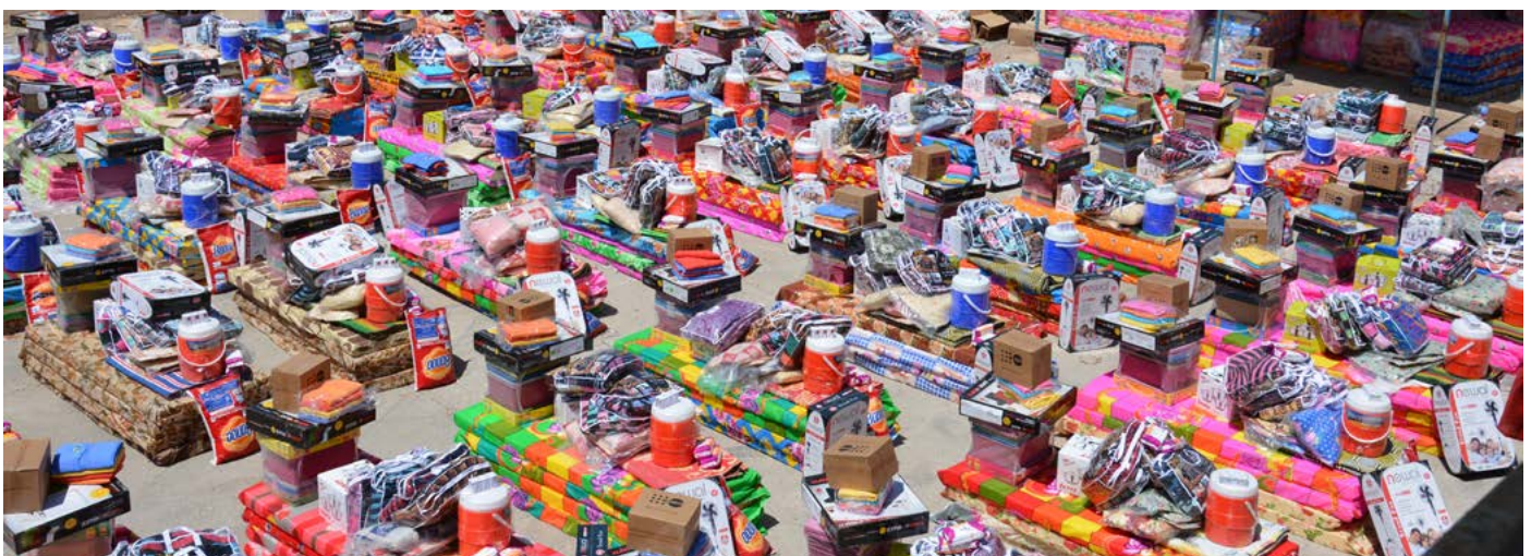
IOM distributes NFI kits and, on behalf of UNFPA, Women's Dignity Kits on August 11 in Darkar, Dohuk governorate