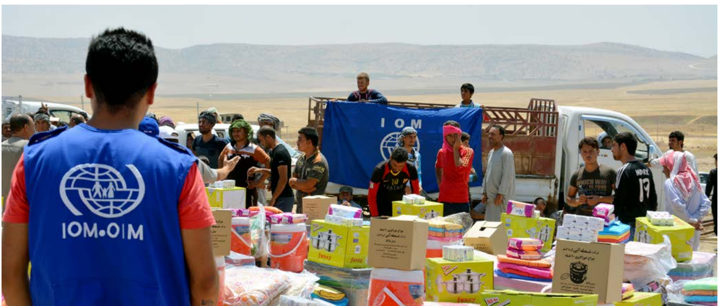
IOM staff distribute NFI kits and, on behalf of UNFPA, Women's Dignity Kits to beneficiaries on August 6 in Shariya, Dohuk governorate