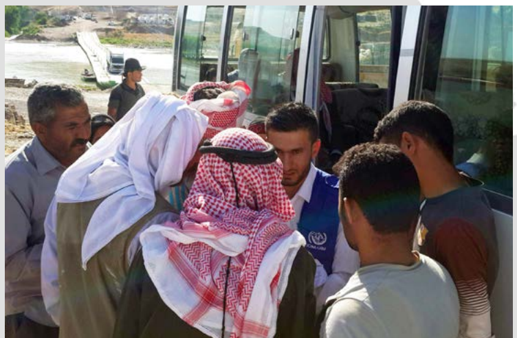
IOM staff facilitate safe transport of beneficiaries from the Feshkabour border to various locations within Dohuk governorate

IOM quickly responds to transport needs as they arise.